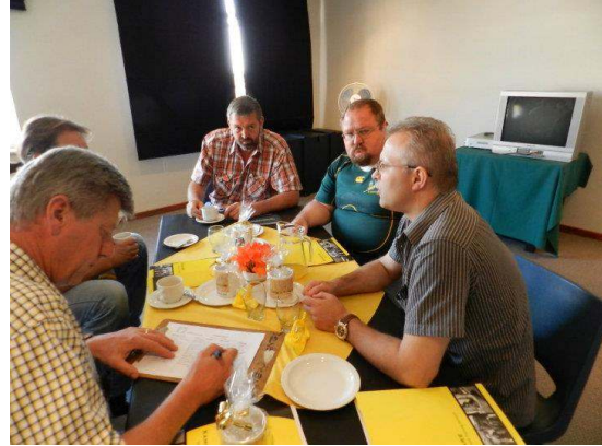
Above: Business men attending the breakfast

Kamcare is currently fully registered to receive Social Economic Development contributions, and will soon also be registered to receive Enterprise Development contributions. This will enable us to maximise all donations and contributions.